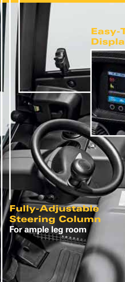
Fully-Adjustable Steering Column For ample leg room