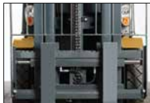
Hang-on or integral sideshifter