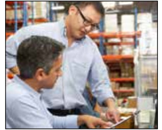
Custom financing packages