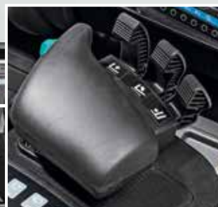
Standard Fingertip Controls