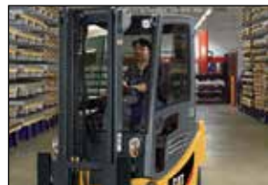
Wide range of enclosed cabin options