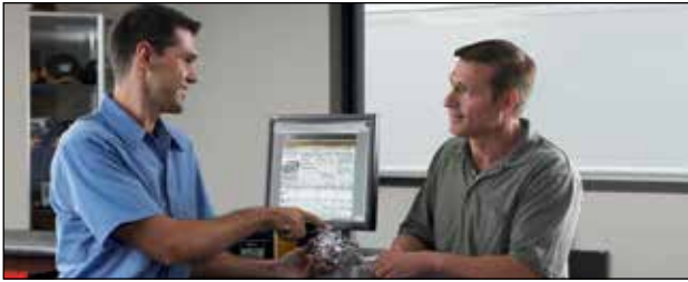
Local service and support