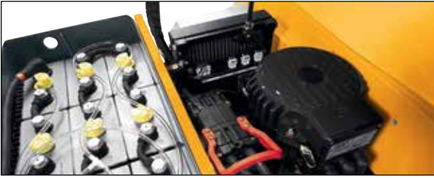
Factory warranty for added protection