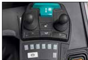
Operator control options